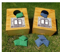
Bean Bag Toss

Details at BPL: 231-882-4111 or www.benzoniamlibrary.org/library-of-things