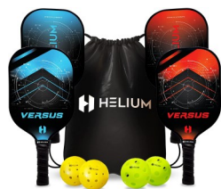
Pickle Ball Set