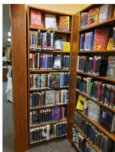
Shelving has been added to the Young Adult & Fiction areas.

Several improvements have been made thanks to funding from the Friends of BPL.