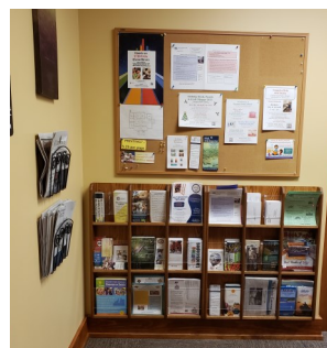
New display areas for brochures & programming materials.