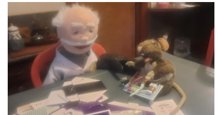
Dr. Fizz & Boomer creating their next great invention

Did you know BPL has the littleBits Base inventor Kit available to borrow? This introductory kit includes everything creative kids need to turn their ideas into inventions! With a range of Bits that move, light up, and make noise, kids gain STEAM skills by learning how technology is built and how it functions. Use the littleBits app to access step-by-step instructions that guide kids through building fun inventions, like a voice-activated robotic gripper arm or a room-protecting intruder alarm, with littleBits' electronic blocks. Over 12 in-app activities and stories of real-world inventors inspire kids to create their own inventions. Through hands-on and digital play, littleBits empowers kids to be creators and inventors with technology, not just consumers of it. The littleBits experience goes beyond product; it enables kids to understand the world around them. Our kids will live in a world of AI, self-driving cars, and space travel. littleBits instills transferable skills in our kids to help prepare them for the jobs of the future. All littleBits electronic blocks (even in other kits!) can be combined and reconfigured to create brand-new inventions. Dr. Fizz and Boomer are designing an automated alarm system to protect their lutefisk and cheese collection.