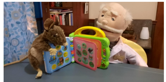
Dr. Fizz and Boomer playing with the LeapFrog 100 Animals Book

Leap on over to the children's room and check out the LeapFrog 100 Animals Book! This learning tool from the groundbreaking LeapFrog company, is a #1 best-seller and patron favorite, and for good reason: It is amazing. Six double-sided, touch interactive pages feature animals from 12 different environments such as the forest, the ocean and the shore as an early introduction to science concepts. Kids can explore the book through three different play modes and hear the animal names read aloud, the sounds they make and learn fun facts. Flip the switch to learn new words for animals, habitats and facts in both English and Spanish. To really top it off, the 100 Animals Book plays three songs to emphasize all the fun and learning.