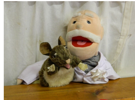
Boomer and Dr. Fizz

Puppet Show broadcasts are available at www.benzonialibrary.org and on the Benzonia Public Library YouTube channel