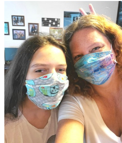
Girl (age 15) with her mom (same household)

We are looking at creative ways to generate income since book sales had to be cancelled this summer. Donations of clean, good quality cotton, batik, & muslin fabric is appreciated for masks & other craft projects. Call 231-383-3597 to schedule donations.